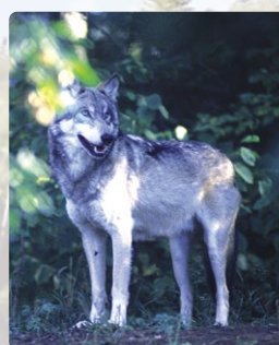
The Wolf Center, Ely

Day 6/7 > Depart for Duluth via the North Shore Scenic Drive , an All-American Road, along the coast of Lake Superior . The 154 mile North Shore scenic coastal seashore drive is truly dramatic. Lake Superior encompasses 8 state parks and brims with natural wonder. Spend some time exploring Duluth known for its rocky shoreline and Canal Park with its iconic Aerial Lift Bridge . 120 miles to Duluth ★ Suggested stops include Split Rock Lighthouse Historic Site and Gooseberry Falls State Park . Appreciate the areas beauty & wilderness by hiking The Superior Hiking Trail .