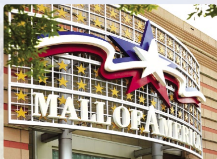
The Mall of America

Day 5 > Explore the Boundary Waters Canoe Area Wilderness (BWCAW) on a day canoe trip, a 1.09 million acre wilderness area within the Superior National Forest . National Geographic magazine rated it among 50 places of a lifetime that any serious world traveller must visit. This is a roadless wilderness accessible only by canoe or kayak! 100 miles to campground ★ Try your hand at fishing which is a popular activity. Game species includes pike, smallmouth bass, yellow perch & lake trout. Maybe you will even spot some beavers, bears, moose or bald eagles. www.canocountry.com/stay/campgrounds.htm