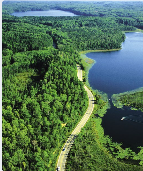
Edge of the Wilderness Scenic Byway

Day 4 > Today you drive to Ely, named America's coolest small town by Budget Travel magazine. Visit the North America Bear Center which provides a detailed insight into the lives of the black bears that roam Minnesota's northern woods. Also located at Ely is the International Wolf Center , featuring a resident wolf pack and