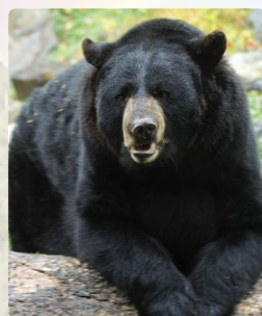
Black bear, North America Bear Center, Ely